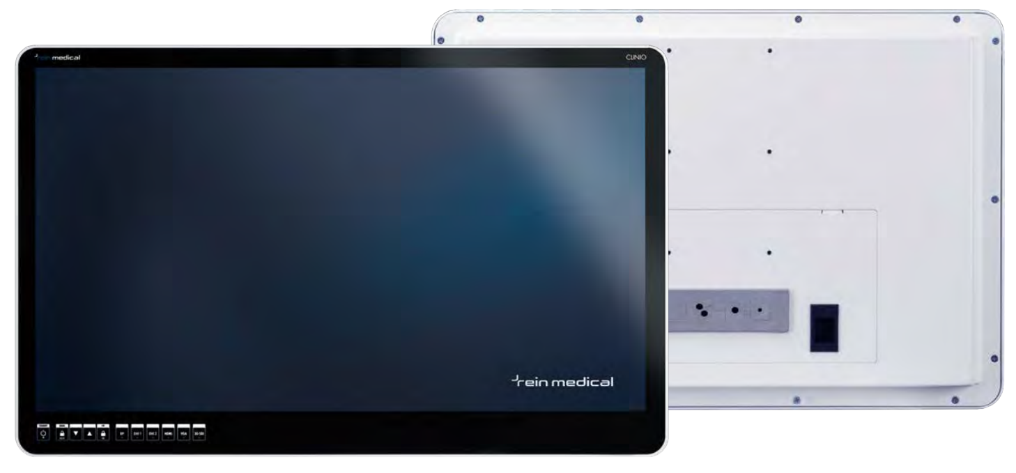
Illustration of a CLINIO 32" UHD (COMMAND BAR depending on controller)

All CLINIOs have an internal power supply unit. This enables simple installations, e.g. in the operating theatre on a ceiling arm. If desired, the CLINIO can serve as a power source for other components. An external power supply unit is also available as an option, so it can also be operated with an external voltage source.