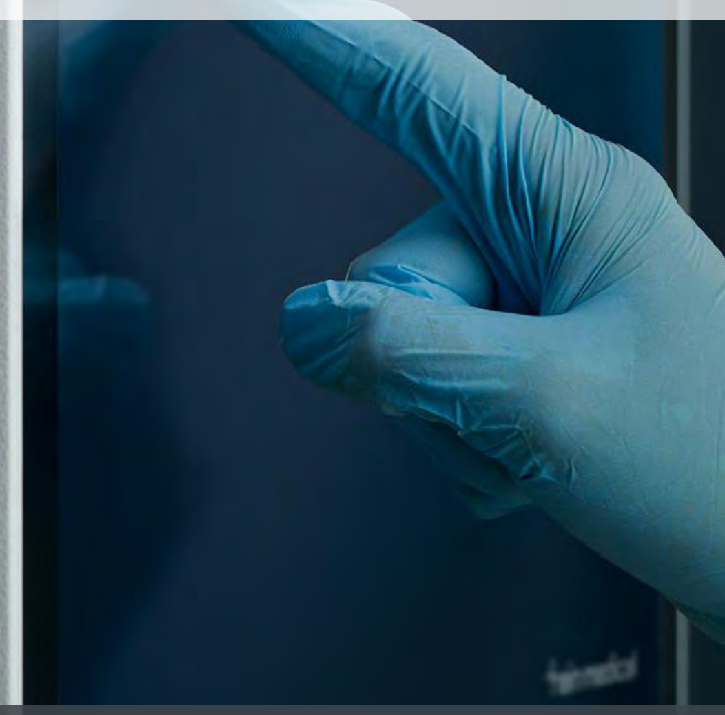
The hygienic flap and the various cable seals prevent dust, dirt and liquids from entering the housing