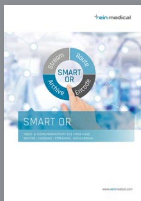
Order No. BR-DE-SOR

On request we'll send you our brochures free of charge. Just send us an e-mail stating what brochure(s) you want to info@reinmedical.com . You can also download all brochures as PDF files at www.reinmedical.com