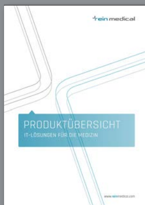
Order No. BR-ES-PRK

Rein Medical provides you with comprehensive information. For individual products and for complex integration projects: Our brochures tell you all about important features, advantages and application examples at a glance.