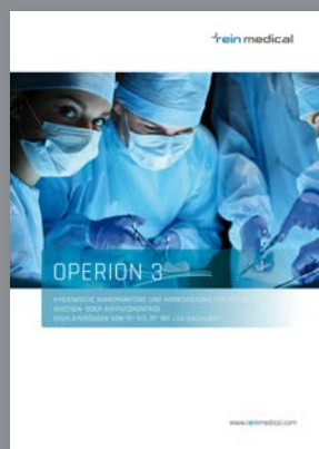
Order No. BR-DE-OP3